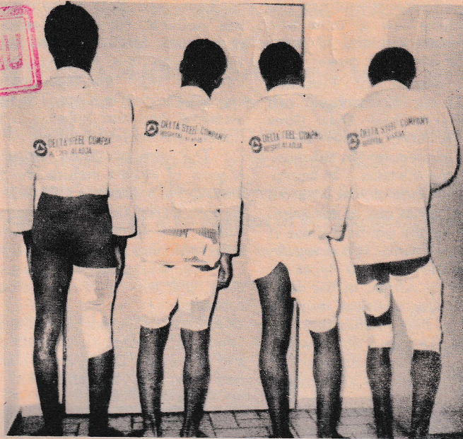
Four of the ten uninsured victims of the Delta Steel explosion