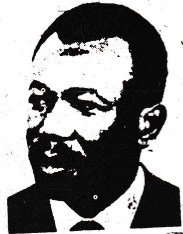
Colonel Mengistu Haile Mariam

Our long-term objective is to eliminate any future recurrence of food-deficit situations in our country. That can be spelled out as the development of the necessary capability to withstand the impact of cyclical drought and finally break the cycle itself. This would involve, among other things, increasing the productivity of the rural sector, a sustained redistribution of rural manpower and an effective programme of environmental rehabilitation. With a party that has already proved its worth and a hard-working people, we are more than sure that we can give an adequate response to this major challenge.