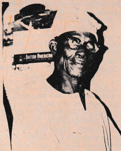
PA IMOUDU (a.k.a. Labour Leader No. 1)