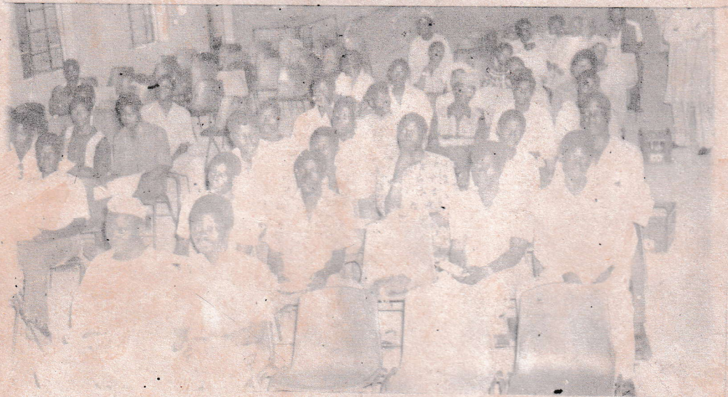
The Composite Campaign picture here comes from Akure, capital of Ondo State, where the Peace Signature Campaign is going on at present