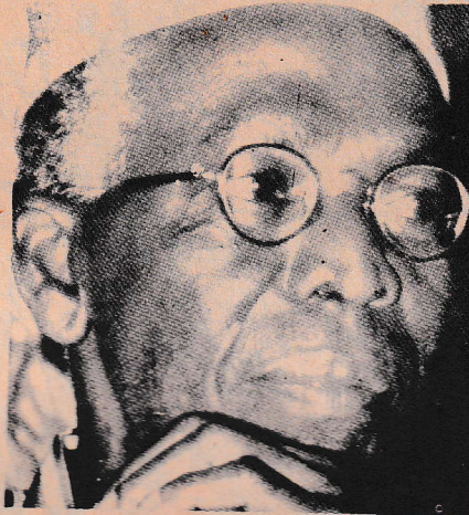
Late Pa Awolowo