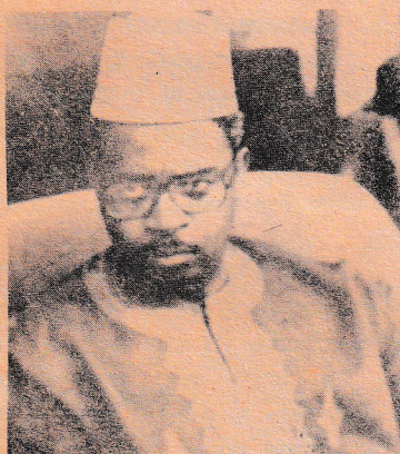
Lt. Gen. Theophilus Danjuma