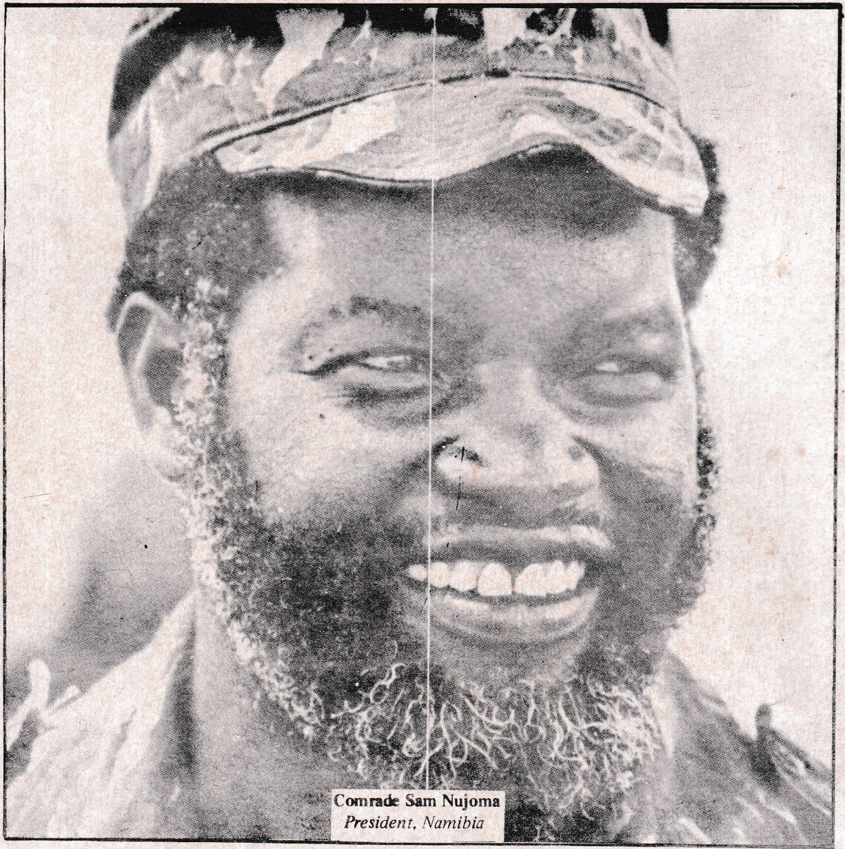
Comrade Sam Nujoma President, Namibia