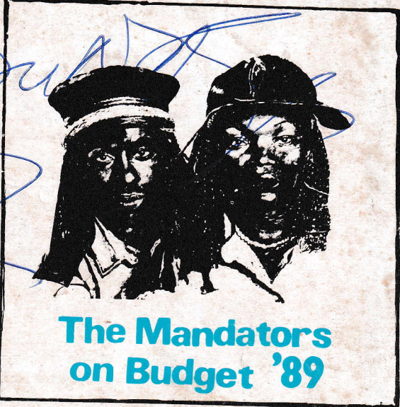
The Mandators on Budget '89