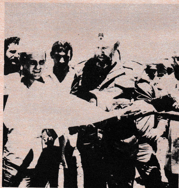
President Fidel Castro denies an alleged rift with the Soviet Union since perestroika was launched