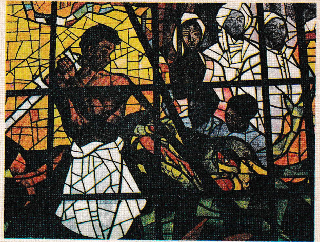
The stained-glass panel in Africa House. 1961-1963. A detail