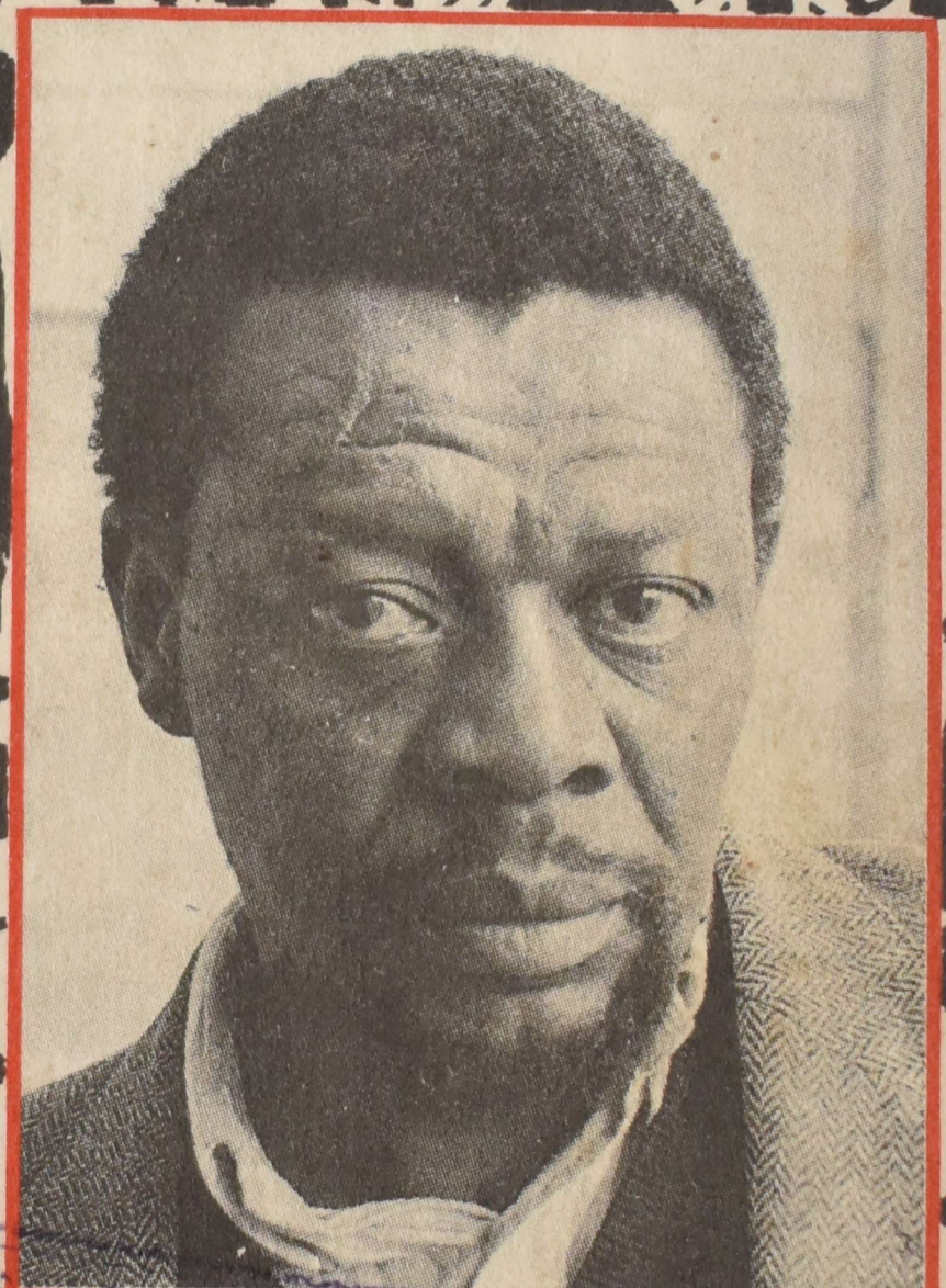
Mongane Wally Serote

THE ROLE OF CULTURE IN THE AFRICAN REVOLUTION