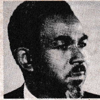
Carlton B. Goodlett