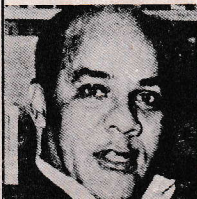
John O. Killens