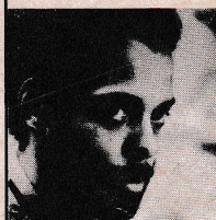
Haki Madhubuti (Don L. Lee)