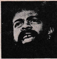
Imamu Amiri Baraka (LeRoi Jones)