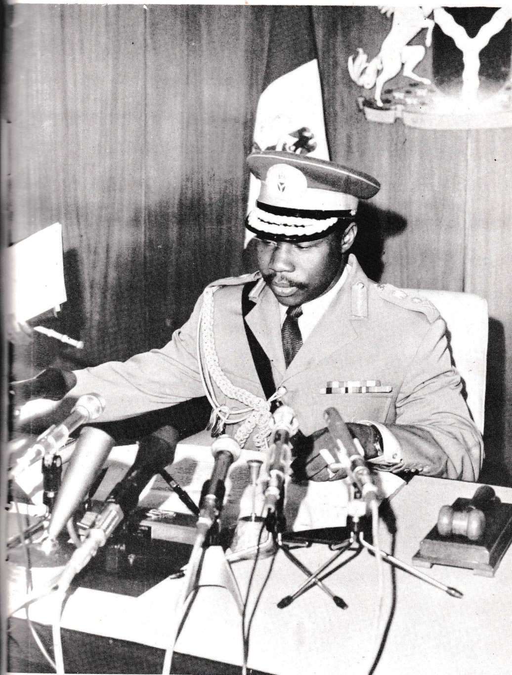
His Excellency Lt.-General Olusegun Obasanjo, Head of State and Commander-in-Chief of the Armed Forces of the Federal Republic of Nigeria.